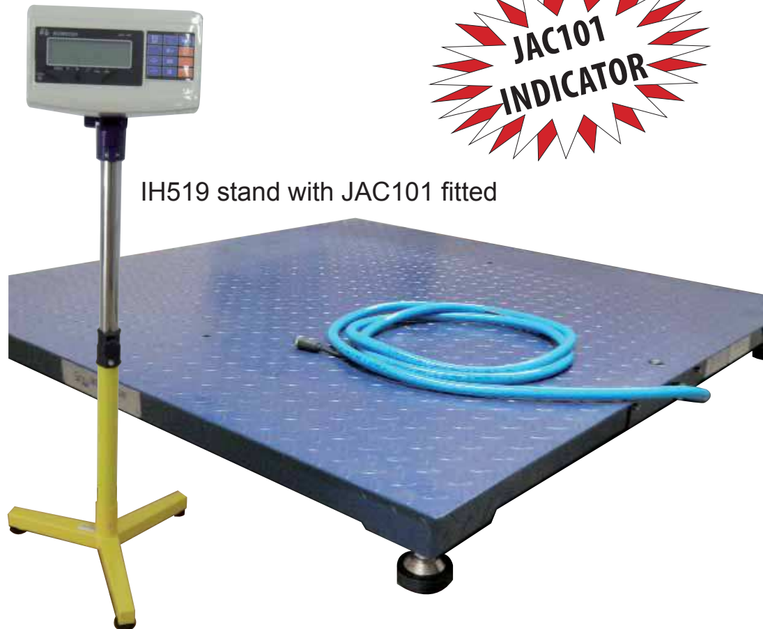
IH519 stand with JAC101 fitted